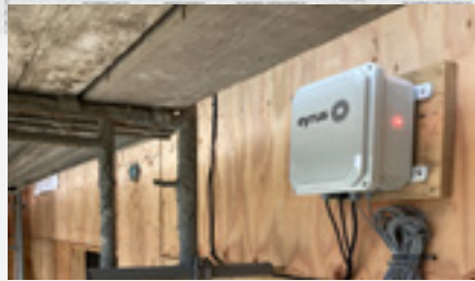
NFC Control Box