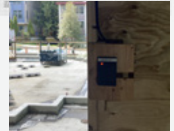
L2 Badge Out