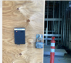
L2 Badge In